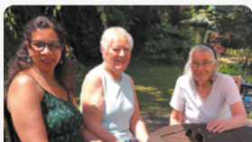
Torch Together Holiday

Pray for the people who are getting ready for their Torch Together holiday in High Leigh next week.